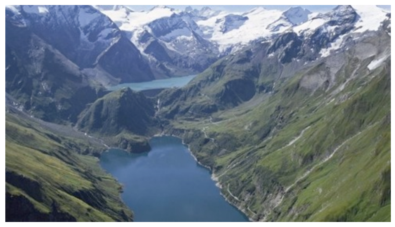
pumped storage power plant in Kaprun, Salzburg (Austria)