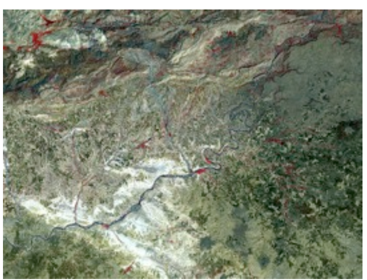
Landsat4 image of pre-Atatürk Dam Harran (August 20, 1983)