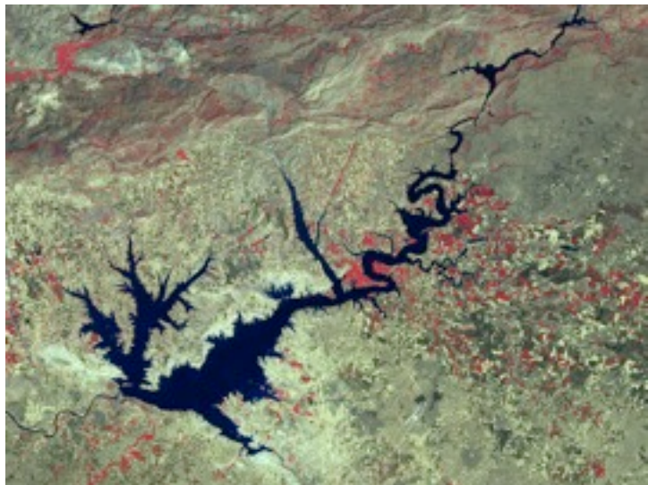
Landsat7 image of post-Atatürk Dam Harran (August 24, 2002)